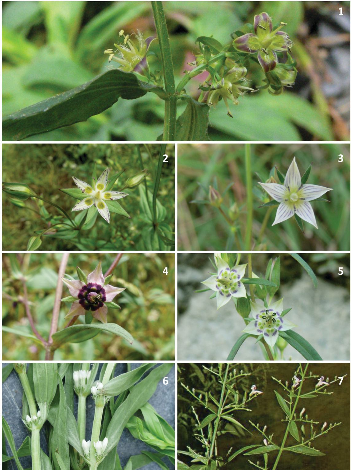
Various plant species used as 'Chiretta' (1. Swertia chirayita ; 2. S. cordata ; 3. S. tetragona 4. S. ciliata ; 5. S. paniculata ; 6. Enicostemma sp.; 7. Andrographis paniculata )

perhaps lends some sanctity to the use of unrelated species as 'equivalents'. For example, plant material obtained from species pertaining to three different genera i.e. Berberis , Mahonia and Coscinium is used as 'daruhardira' as all these plants contain 'berberin' as the major organic