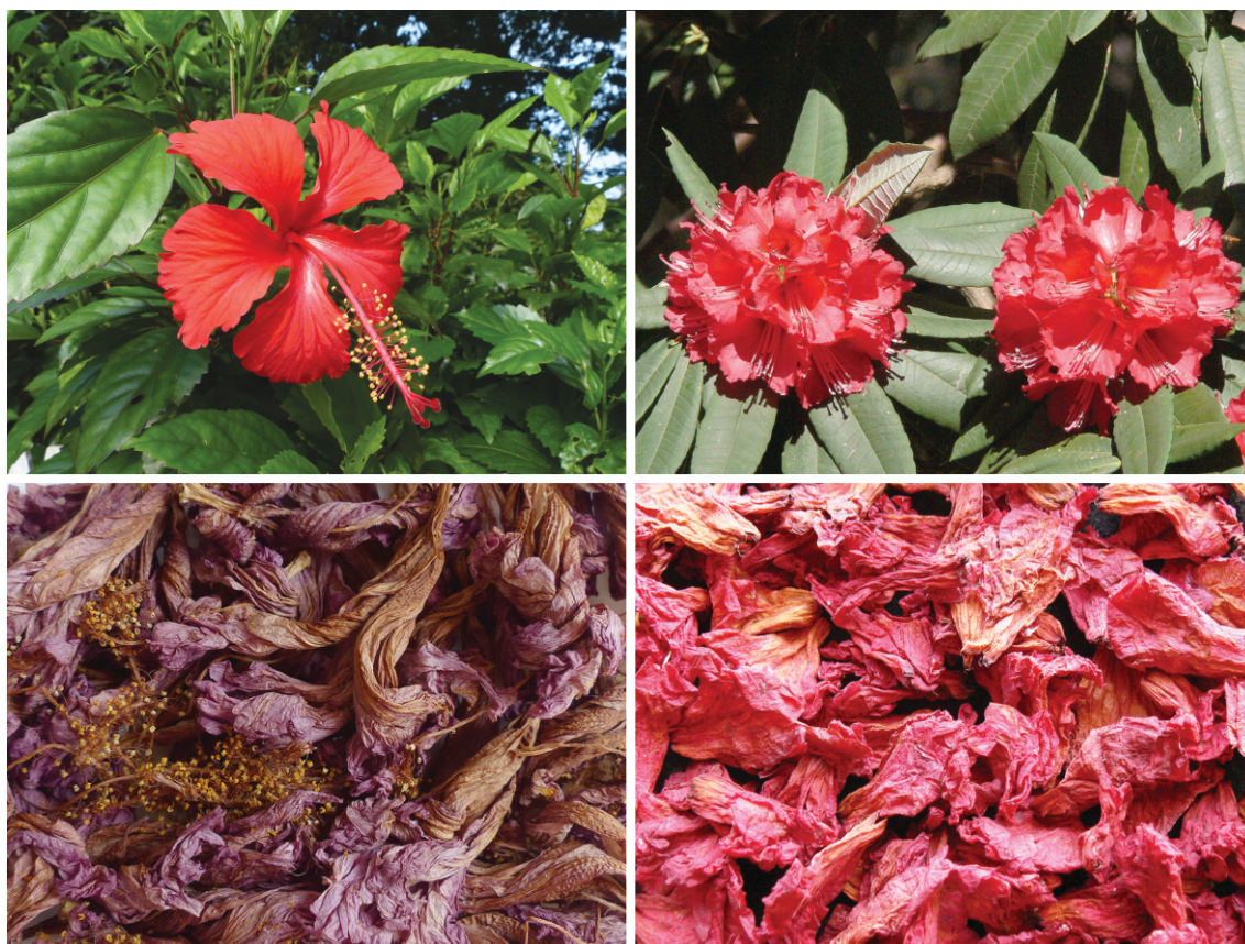
Hibiscus - fresh and dried flowers

locally known as 'Gularh phool' in Chamba district in Himachal Pradesh. The mix up, seemingly due to similarity of names, also explains the vast difference in rates of this herbal raw drug in the market.