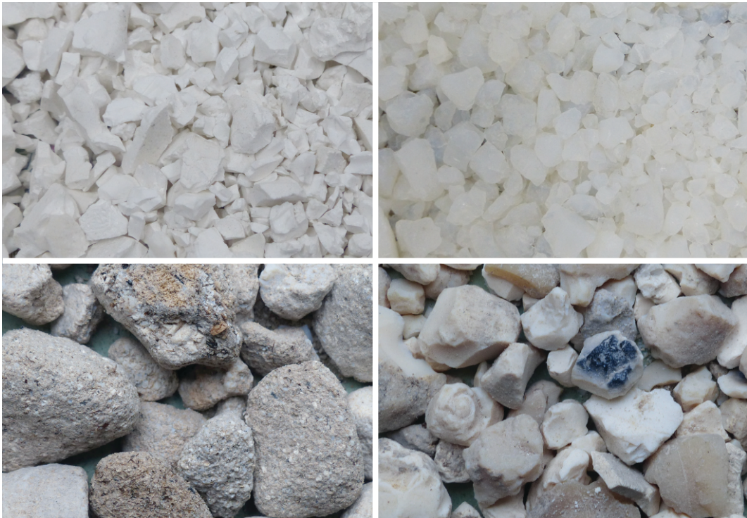
Different grades of 'banslochan' recorded in Trade

An estimated 2000 MT of Banslochan or Tabashir is used annually by the herbal industry in India making Ayurvedic, Siddha and Unani formulations. True 'banslochan' or 'tabasheer' is a translucent whitish substance (sometimes with bluish tint that is considered to be of superior quality) composed mainly of silica and water with traces of lime and potash, collected from the nodal joints of various bamboo species viz. Bambusa bambos , Bambusa balcooa , Melocanna bambusoides , etc. However, neither any record of wild collection of 'banslochan' in the country is available nor such collection has come to the notice during extensive field surveys during the course of this study. Similarly, analysis of foreign trade data does not show any record of import of such large quantities of 'banslochan'. Huge quantities of 'banslochan', nevertheless, continues to be traded in the market under various names like 'banslochan asli', 'vanshlochan singapuri', 'banslochan desi', 'tawasheer', 'bamboo-manna', etc. with different varieties commanding highly variable prices ranging from less than ₹ 100 per kg to more than ₹ 10,000 per kg.