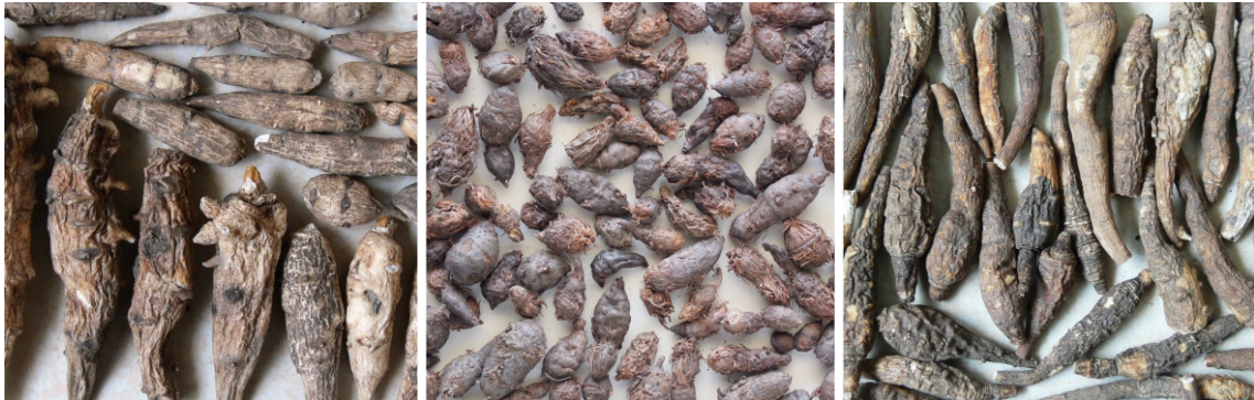
Aconitum heterophyllum (Atees) authentic raw drug

is a long drawn process that is based on assessment of similarity of properties like 'rasa', 'guna', 'virya' and 'vipaka' in both the original and the substitute drug. Thus, substitutes for original herbal raw drug can belong to different plant species in the same family or different families. Treatise by scholars like Bhavaprakasha, Yogaratnakara and Bhaishajya Ratnavali contain detailed description of many 'substitute' drugs.