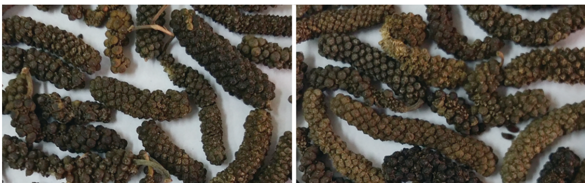
Spurious 'Pippali' Samples from the Market

Flowers of Hibiscus rosa-sinensis , known as 'Gurhal phool', form an important herbal raw drug used in various classical herbal health care formulations. However, during survey of herbal mandis, it was noticed that the raw drug being usually sold as 'Gurhal phool' was actually the flowers of Rhododendron arboreum , a Himalayan tree bearing large scarlet flowers. Retracing the line of supply, it came out that the major supply of the material being sold as 'Gurhal phool' was being obtained from Chamba district in Himachal Pradesh. Further enquiries from the field revealed that the Rhododendron arboreum flowers, commonly known as 'Burash phool', are