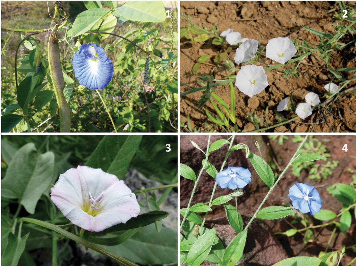
Various plant species used as 'Shankpushpi' (1. Clitoria ternatea ; 2. Convolvulus prostratus ; 3. Convolvulus arvensis ; 4. Evolvulus alsinoides )

India (Prakash et al. , 2013). 'Parpata', widely used in fever and treatment of gastritis, diarrhoea, and excessive thirst, is another herbal raw drug where many 'equivalents' were noted in trade. Some of the raw drugs traded as 'parpata' or 'parpataka' that could be critically correlated with the taxonomic identity of the plants from which these are sourced are Fumaria indica and Fumaria officinalis (Fumariaceae) Polycarpaea corymbosa (Caryophyllaceae), Oldenlandia corymbosa (Rubiaceae), and Mollugo cerviana (Molluginaceae).