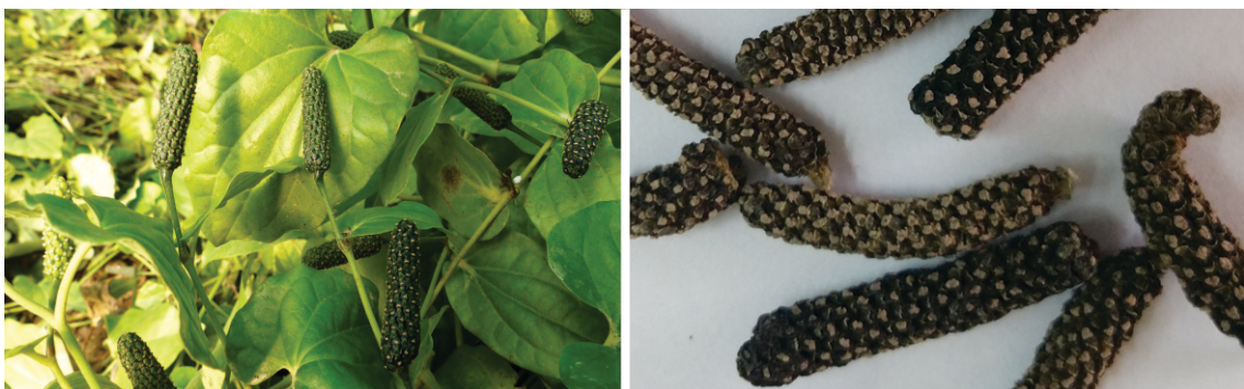
'Pippali' plant and Authentic Sample of 'Pippali'

'Adulterants' is the third and the most worrisome category of controversial herbal raw drugs. The extent of adulteration varies from the unintended mixing of foreign material with the accepted herbal raw drug due to inexperience of wild gatherers who sometimes gather similar looking plants at the time of collection to the deliberate mixing of foreign material or inferior quality material in the accepted herbal raw drug with the intent to make profit. 'Adulteration' also varies from small percentage of foreign material, including non-accepted parts of the same plant, added to the main herbal raw drug to the entire lot being spurious. 'Adulterants' cause debasement of the accepted herbal raw drugs adversely impacting their therapeutic and chemical properties. Irrespective of the intent behind adulteration of the herbal raw drug material, it is very difficult to separate the adulterated material once it is dried and aggregated. Many instances of 'adulterants' were noticed during the current study. One such instance related to market samples with seemingly deliberate mixing of similar looking fruiting spikes of different Piper species with Pippali ( Piper longum ).