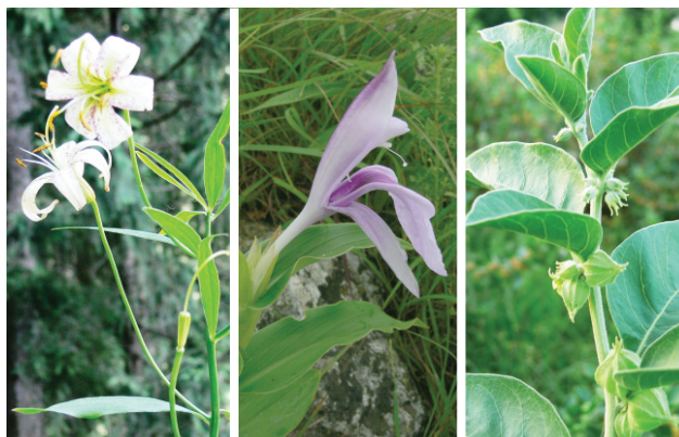
Lilium polyphyllum (Kshir Kakoli)

In many cases, where the original herbal raw drug is not available due to population reduction or due to geographical considerations, the use of 'pratinidhi dravaya' or the 'substitute' is allowed and in such cases the plant source of the original herbal raw drug and the one that is used as substitute are well known. As an example, 'ashwagandha' ( Withania somnifera ) is recognised as a substitute in place of 'kshir kakoli' ( Lilium polyphyllum ), a Himalayan herb no more available in commercial quantities. The plant sources of both these herbal entities are clearly known. Identification, recognition and validation of 'substitute' herbal raw drugs